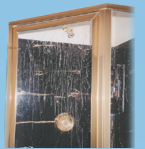
Hard Water Stains