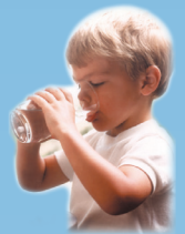
Unsafe Drinking Water