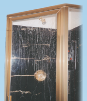
Hard Water Stains